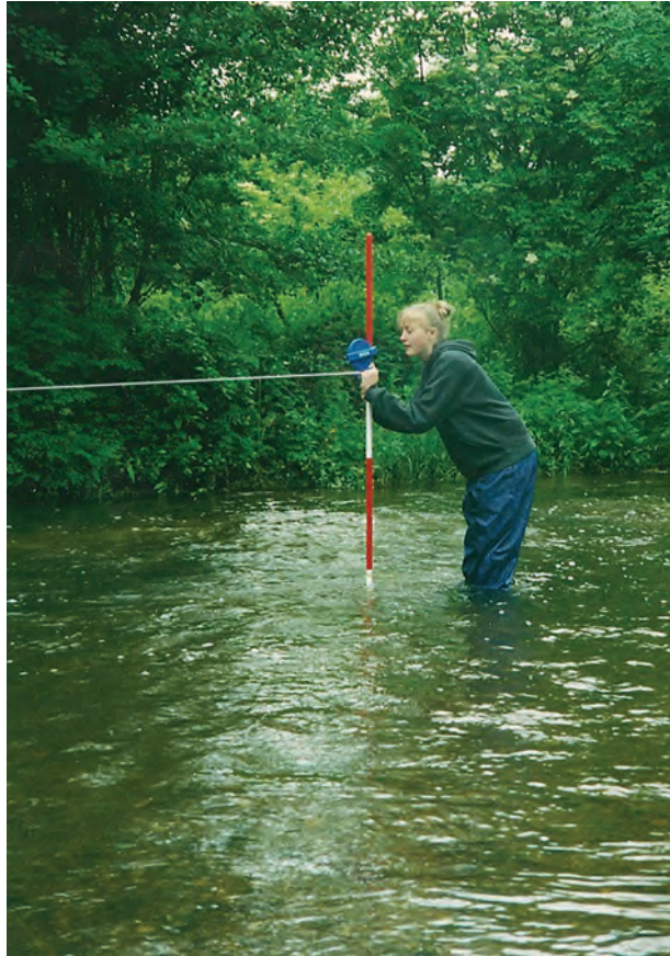
Photograph A for Question 2